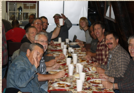
Calvary Chapel Men's Group Enjoying Breakfast

Space with plenty to do: With 28 acres here on camp, there is plenty to explore and room to play.