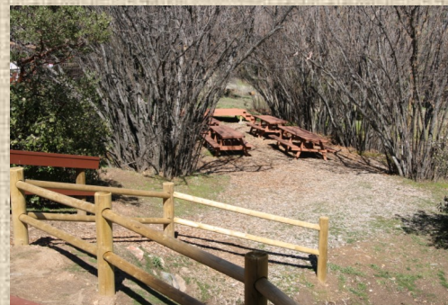
Great Retreat Center for adults and youth alike!